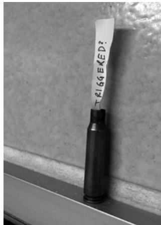
Figure 4. “Triggered?” UT Austin.

inside which was stuffed a tiny scrap of paper with a single word: “TRIGGERED?” 29 (see Figure 4 ).