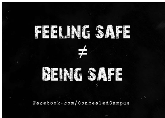
Figure 2. http://concealedcampus.org/images-slider/axiom-002.jpg (accessed 5 May 2019). Use permission granted by Students for Concealed Carry.

says this much more simply: “Feeling safe or unsafe is not the same as being safe or unsafe.” 23 And their meme boils it down even further (see Figure 2).