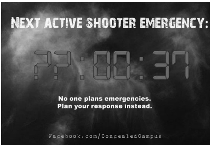
Figure 1. http://concealedcampus.org/images-slider/axiom-008.jpg (accessed 5 May 2019). Use permission granted by Students for Concealed Carry.

Nor should one necessarily correlate the logic of preparedness with fear. As focus shifted after the Cold War from the material world of bomb shelters to the human sphere of behavior, people are expected to be hardened, not sensitive, to shooter events. 20 Furthermore, while it could be argued that preparedness reflects a growing societal sense of ontological insecurity, 21 whatever the current bogeyman may be, gun rights groups fundamentally reject the connection between fear and security.